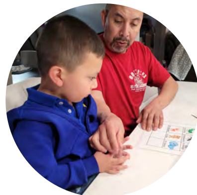
We offer groups in English with Asheville City Schools and in Spanish with PODER Emma

Our Week of the Young Child kickoff event at Rabbit Rabbit offered kids and families exciting and educational activities. We also invited families to play with their kids and learn about free and low-cost resources. Over 500 people joined in the fun!