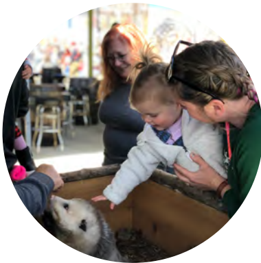
Appalachian Wildlife Refuge introduced their friendly ambassadors

Our Week of the Young Child kickoff event at Rabbit Rabbit offered kids and families exciting and educational activities. We also invited families to play with their kids and learn about free and low-cost resources. Over 500 people joined in the fun!