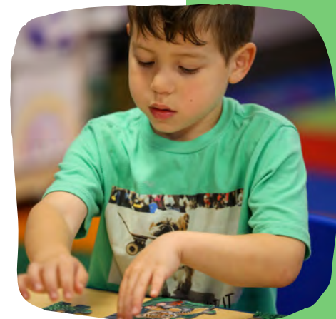
A YWCA pre-k student does a puzzle

If this pilot project succeeds and is extended, the goal for the Buncombe County Commission would be to double the number of slots in local NC Pre-K programs from 441 to 914 by 2030.